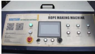
PLC和触摸屏 PLC and touch screen control panel

注：以上产品外形或技术参数如有变化，恕不另行通知。Note: All technical parameter are subject to change without notice.