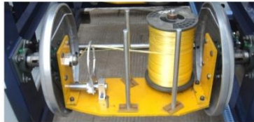
放卷 Pay-off packages